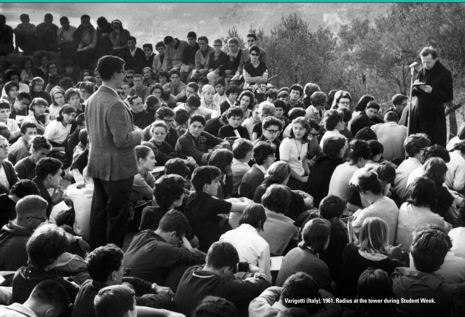
Varigotti (Italy), 1961. Radius at the tower during Student Week.

because you have been called to this road. You will love your wife better, you will love your friends better, you will love your children better, you will know what it means to be merciful, you will know what it means to forgive, you will know what it means to sacrifice yourself to build so that others can be better off, you will know what it means to be human, you will be more human. ‘Those who follow Me will have eternal life,’ which is Him, the relationship with Him” (L. Giussani, In cammino [On the Road] 1992-1998 , Bur, Milan, 2014, pp. 226-27). Fr. Giussani never changes a jot! Eternal life is Christ. Salvation is Him. Only by remaining bound to Him on this road can we see our relationships blossom, can we build, can we be open to the needy, can we be ever more human.